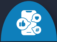
Technology, Media & Telecommunication